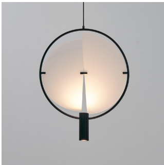
white PC + matt black